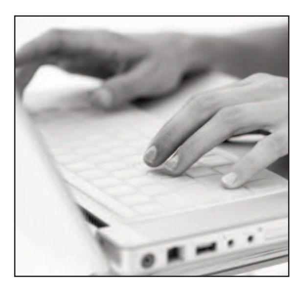
"Employment of social workers is expected to grow by 25 percent from 2010 to 2020, faster than the average for all occupations."